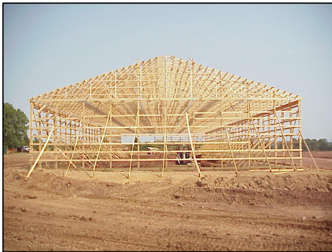
Figure 7 Post Frame Construction

Post frame construction is used widely in the construction of agricultural buildings. Tall columns are embedded in the ground and are braced from buckling by horizontal pur-lins. Roof trusses are supported along the length of the wall by headers attached to the tops of the columns.