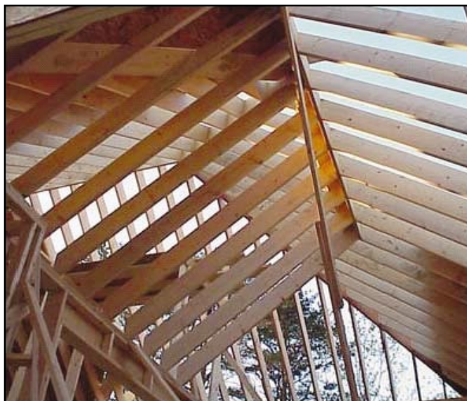
Figure 6 Wall & Roof Framing

Dimension lumber is used for wall and roof framing. When lumber is used for roof framing, it is referred to as rafters. This complex rafter framing will be extremely difficult to detect once the sheathing and drywall are installed.