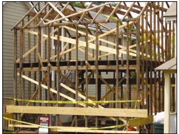
Figure 4 Balloon Framing

Early house construction was “balloon” framed. This house, undergoing major renovation, is a good example of balloon framing. Unless firestopping is added, fire within the wall can easily spread vertically, since there are no top plates. Fire originating in the floor/ceiling assembly can spread horizontally and eventually vertically through the walls.