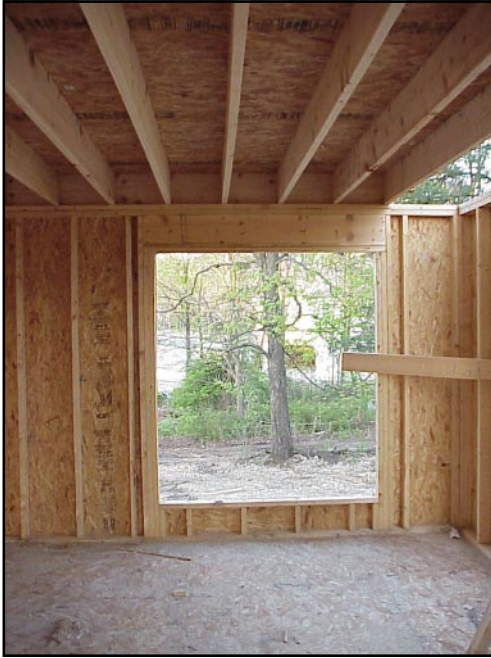
Figure 2 Platform Construction

Platform construction is today's most common method of construction. It combines safety for framers while the building is under construction, with inherent firestopping once the walls are sheathed.