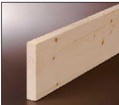
Figure 1 Solid Sawn Lumber

Solid sawn, dimension lumber is used in many aspects of today's house construction. Lumber is used almost exclusively for wall framing. It is still common in floor construction, but less so as roof framing.