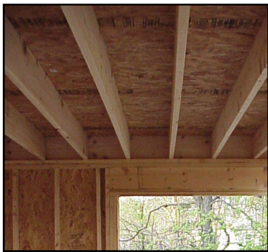
Figure 3 Integrated Fire Blocking

Platform construction provides a structural frame that is fire blocked by virtue of the style of construction—the wall sole plates and top plates isolate the horizontal floor cavity from the vertical wall cavity, as required by building codes. The top plates of the wall prevent movement of fire into the floor cavity. Similarly, the top and sole plates of the wall above prevent fire spread from the floor joist cavity into the walls.